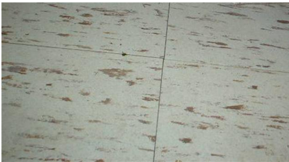
Example of Category I ACM - Floor Tile

ACM is any material containing more than 1% asbestos as determined using Polarized Light Microscopy (PLM). There are two types of ACM. Category I nonfriable ACM means asbestos-containing packings, gaskets, resilient floor covering and asphalt roofing products. Category II nonfriable ACM means any material, excluding Category I nonfriable ACM.