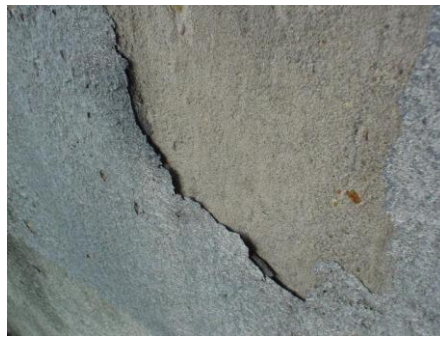
Example of Category II ACM - Cementitious Material

RACM is any friable asbestos-containing material containing more than 1% asbestos as determined using PLM that can be crumbled, pulverized or reduced to powder by hand pressure when dry. RACM also includes Category I or Category II non-friable asbestos material that has become friable prior to, or during, demolition or renovation operations.