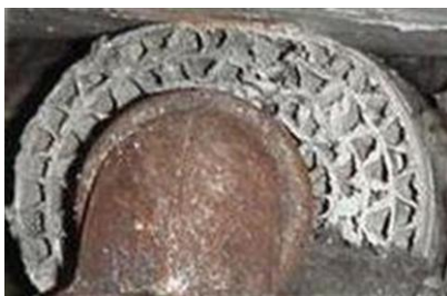
Friable Air Cell Insulation on Pipe

RACM is any friable asbestos-containing material containing more than 1% asbestos as determined using PLM that can be crumbled, pulverized or reduced to powder by hand pressure when dry. RACM also includes Category I or Category II non-friable asbestos material that has become friable prior to, or during, demolition or renovation operations.